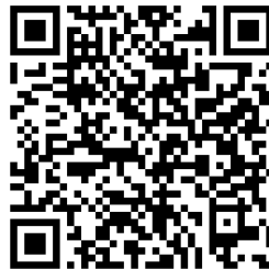
World Relief List