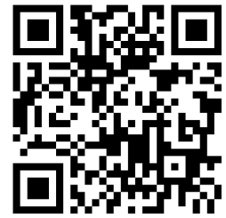
Welcome to IL